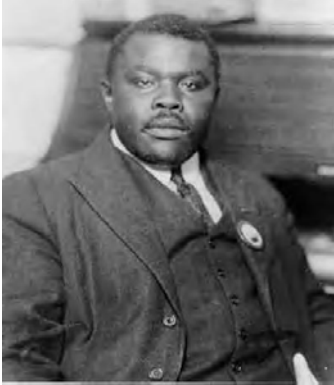
Marcus Mosiah Garvey